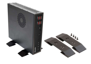
Vertical Stand PS02 for vertical operation