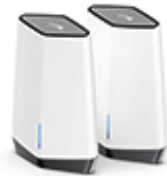
Orbi Pro SXK80 series