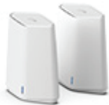
Orbi Pro SXK30 series