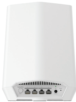
Orbi Pro WiFi 6 Satellite (SXS50)