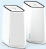
Orbi Pro SXK50 series