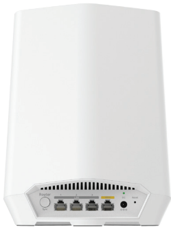
Orbi Pro WiFi 6 Router (SXR50)