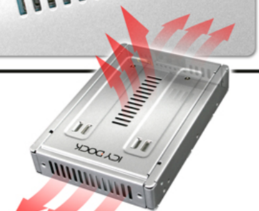
High Flow Air Cooling Vents