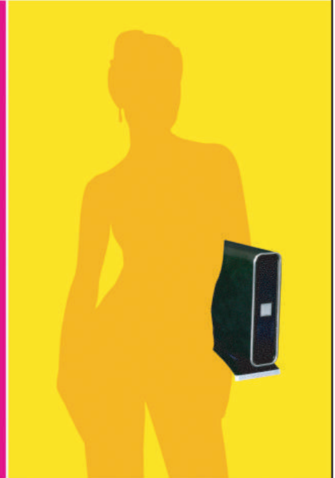
ICY BOX IB-360B