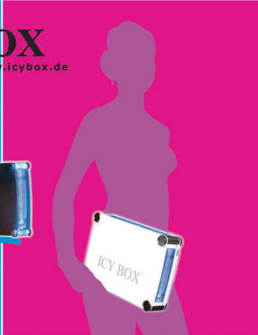
ICY BOX IB-550