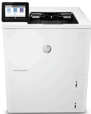
HP LaserJet Enterprise M611x